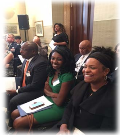
Audience deeply engaged

Though many in the workshop considered themselves to be highly aware of diversity issues before participating, all nevertheless were reminded through the results that they are subject to biases and need to set up systems that will mitigate this very human characteristic.