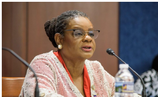
Representative Gwen Moore