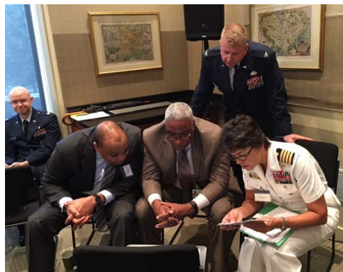
Working on the simulation