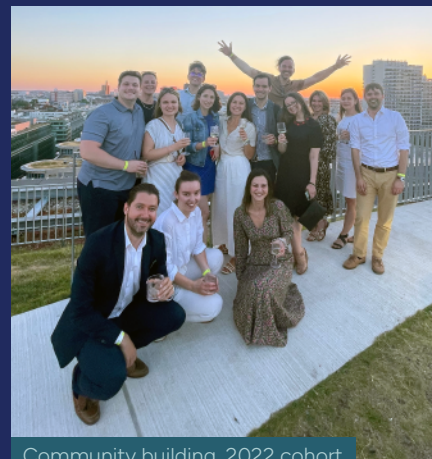
Community building, 2022 cohort

skills. The ReThink.CEE Fellowship seeks to fill this gap and to support talented individuals in conducting creative and timely policy research. In doing so, it also strengthens the capacities of the think tank and civil society sectors of the region, and promotes high-quality, evidence-based policy thinking in addressing regional challenges.