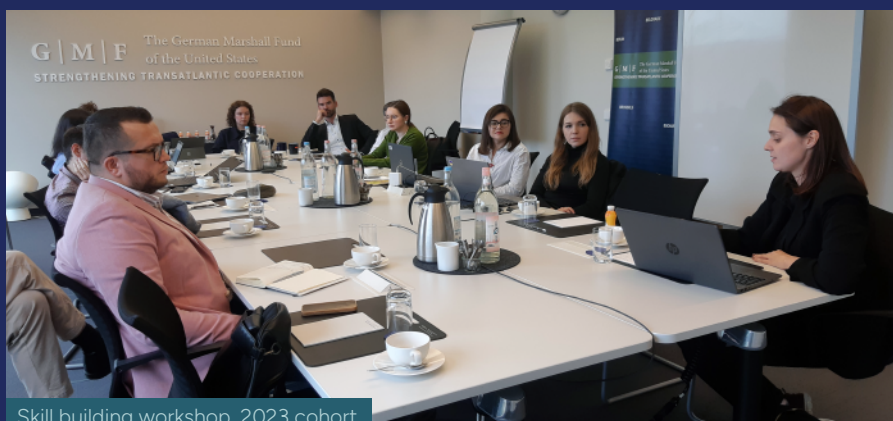
Skill building workshop, 2023 cohort

GMF maintains strong ties with ReThink.CEE fellows beyond their fellowship period through a growing alumni network, offering continued opportunities for professional engagement and collaboration, including mentoring new fellows as well as speaking and publication opportunities with GMF. This sustained engagement strengthens long-term connections across the think tank and civil society sectors of Central and Eastern Europe, fostering a more vibrant and cohesive policy exchange among the next generation of the region's experts.