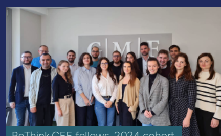
ReThink.CEE fellows, 2024 cohort

A stipend and a travel and research budget provide fellows the means to conduct fieldwork, to network with stakeholders, and to dedicate the necessary time to deliver a quality policy paper by the end of their fellowship.