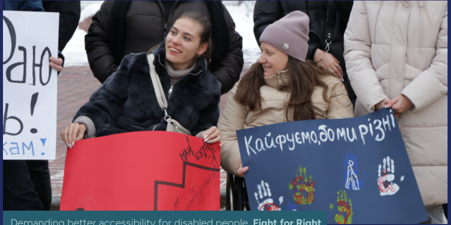
Demanding better accessibility for disabled people, Fight for Right

FIGHT FOR RIGHT works to strengthen the rights of people with disabilities in Ukraine. Since Russia's full-scale invasion, it has managed evacuations, humanitarian aid, and medical support for this most vulnerable community. It also set up a psychological-support helpline as anxiety skyrocketed among them. The helpline receives around 50 calls in a calm week and up to 100 calls per day when fighting intensifies. The Fight for Right team has handled over 20,000 requests for support since February 2022.