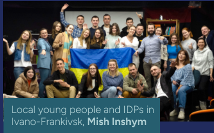
Local young people and IDPs in Ivano-Frankivsk

UKRAÏNER is a media project that aims to discover and highlight Ukraine's unknown sides and sites.