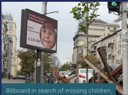
Billboard in search of missing children, Magnolia

The NGO MAGNOLIA was set up by journalists in 2001 to use the media in searching for missing children and to protect the rights of vulnerable children and families in Ukraine. Since Russia's full-scale invasion, Magnolia has received and processed over 3,000 search requests for missing children. The fate of all but 180 has been established, with most established to be alive.