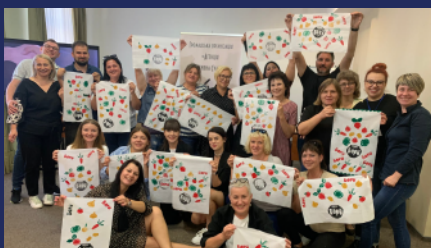
Participants of the Recovery Leaders 2.0 program, Creative Sumy Region Agency

The CREATIVE SUMY REGION AGENCY was established in early 2022 and, with the full-scale Russian invasion, prioritized urgent humanitarian and social support. It has now returned to its original mission of forming a cluster of creative professionals, initiatives, and industries in Sumy region.