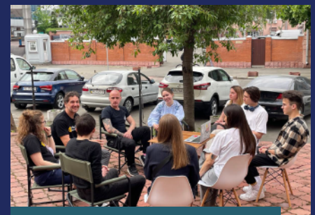
Legal clinic for volunteers, Charitable Foundation "Lawyers' Move"

volunteers and civil society organizations. In 2023, it provided 132 legal consultations to new civic initiatives and prepared legal guidelines for volunteers. In so doing, it empowers volunteers and new civic initiatives, and it expands the collective capacity of Ukraine's civil society.