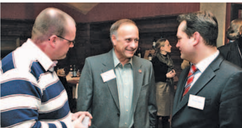
Members of the German Bundestag [from left] Hoger Haibach and Alexander Bonde, and U.S. Congressman Steve King discuss the day's events at the 2009 Congress-Bundestag Forum.