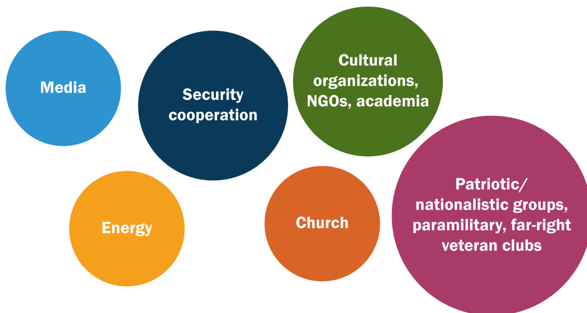
Figure 2. Russia's power toolkit in the Western Balkans

Russia has been seeking to build a network of narrative proxies—local state and non-state information agents that willingly promote its interests across the region. Its toolkit in the Western Balkans involves a wide variety of soft-power instruments, along with political and economic pressure.