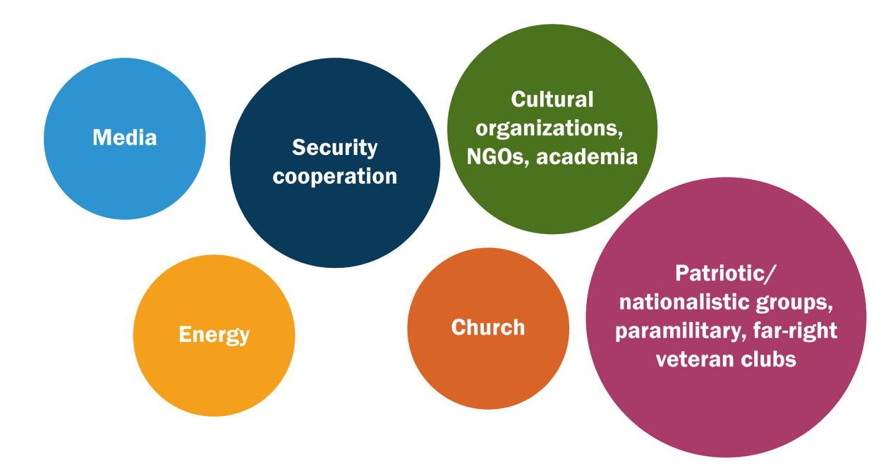
Figure 2. Russia's power toolkit in the Western Balkans

Russia has been seeking to build a network of narrative proxies—local state and non-state information agents that willingly promote its interests across the region. Its toolkit in the Western Balkans involves a wide variety of softpower instruments, along with political and economic pressure.