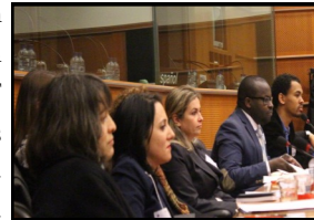
TILN participants at the European Parliament

Guest speakers discussed demographic changes on both sides of the Atlantic, the continuing struggle for Roma to realize equity and inclusion in Europe, and the increasing need for greater minority political representation and implementation of anti-discrimination laws to meet the ideals of inclusive democracy in the U.S. and Europe. As part of the GMF Young Professionals Summit, TILN participants joined other young leaders and government officials (e.g., Wendy Sherman, US State Department Undersecretary) in discussing global issues ranging from austerity measures in Europe to